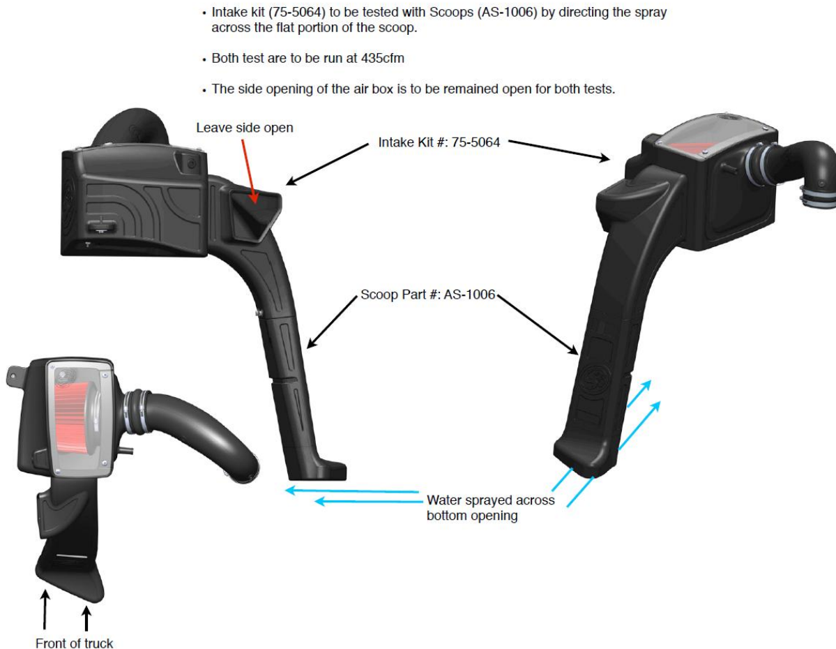
Figure 1. S&B Schematic for Water Testing of 75-5064 Intake with AS-1006 Scoop

It is important to understand the above terminology. Water penetrating the scoop section is the amount of water presented to the upper filtration section, as a percent of the total water collected during the test. Water retained by the upper unit is the amount of water retained in the filtration section (filter and filter housing area) as a percent of the total amount of water collected during the test run. The amount of water collected by the filter is also based on the total amount of water collected during the test run. The total amount of water collected includes water collected in the downstream catch basins. It is also important to note that all testing was conducted under suction only, and with the vent open, only a portion of the air enters the unit through the scoop. It is most likely that a better simulation would include ram air below the inlet in addition to the spray stream. This is doable, but would add some complexity to the test setup and testing protocol.