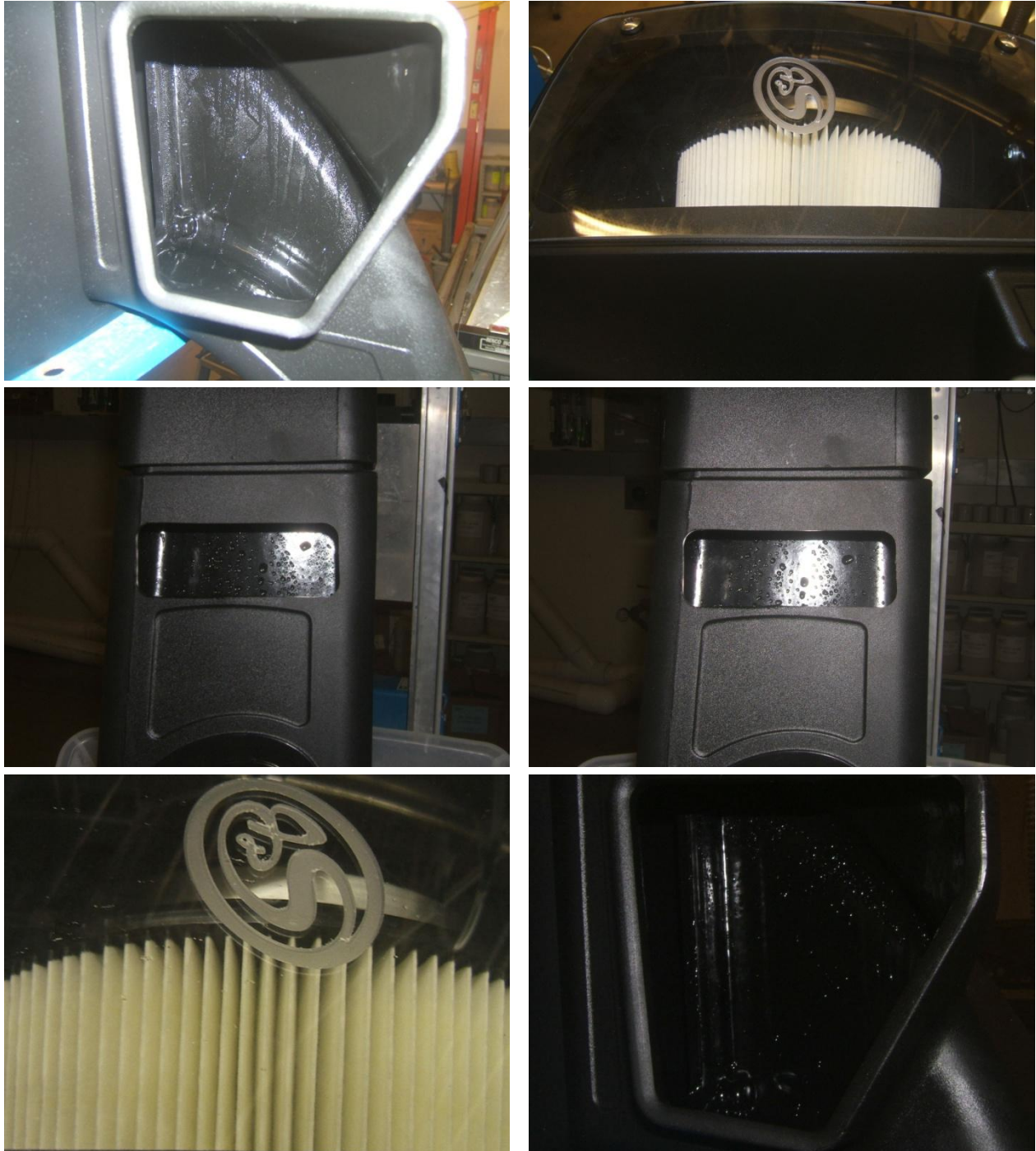
Figure 4. Some General Photographs during and after Testing of 75-5064 Intake (with white filtering media) with AS-1006 Scoop