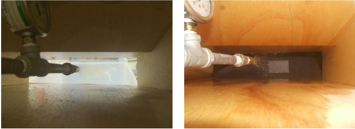
Figure 2. General Test Arrangement for 75-5064 Intake (with white filtering media) with AS-1006 Scoop (top row: airflow testing; other rows: water spray testing) (Continued)