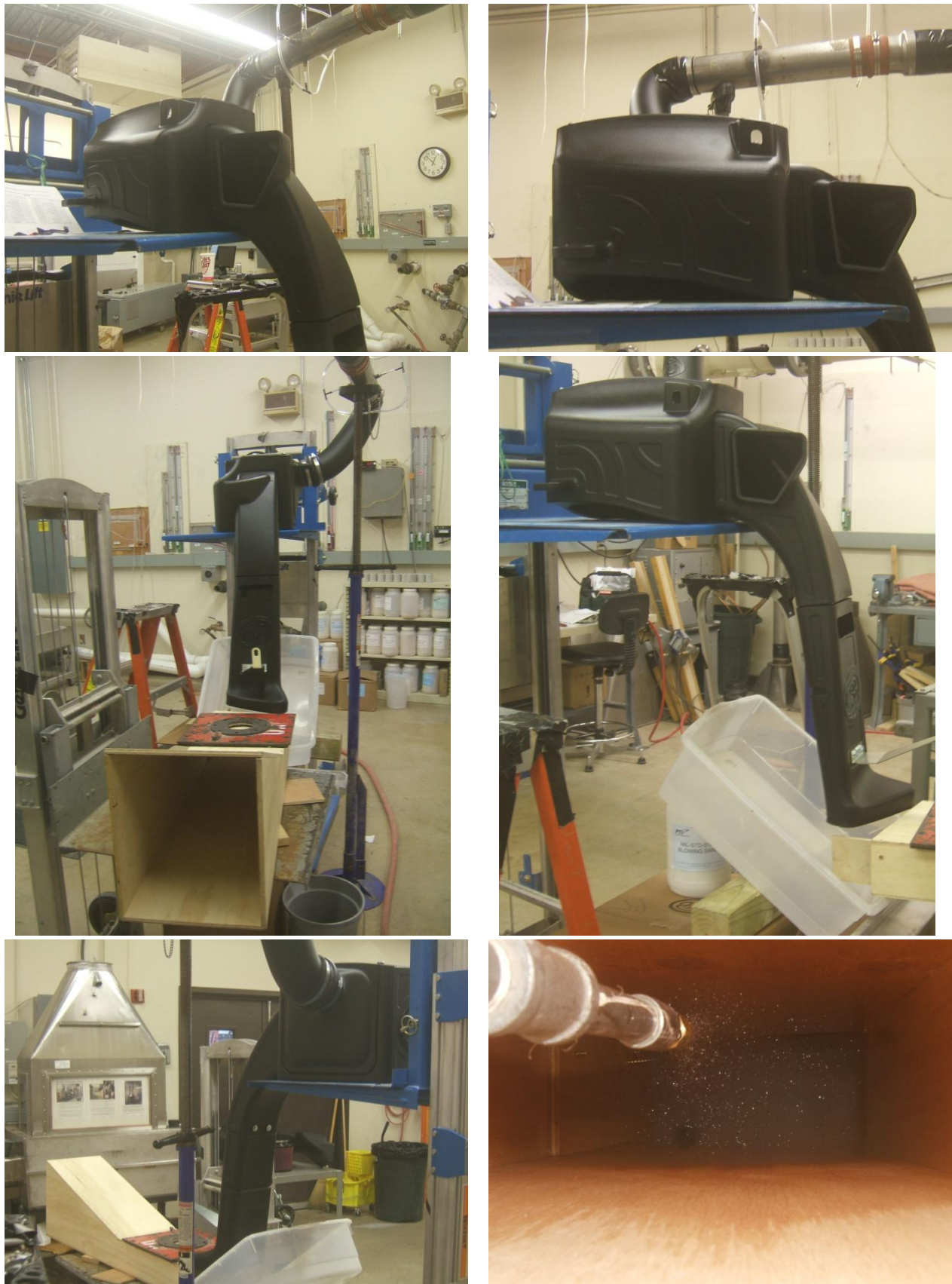
Figure 2. General Test Arrangement for 75-5064 Intake (with white filtering media) with AS-1006 Scoop (top row: airflow testing; other rows: water spray testing)